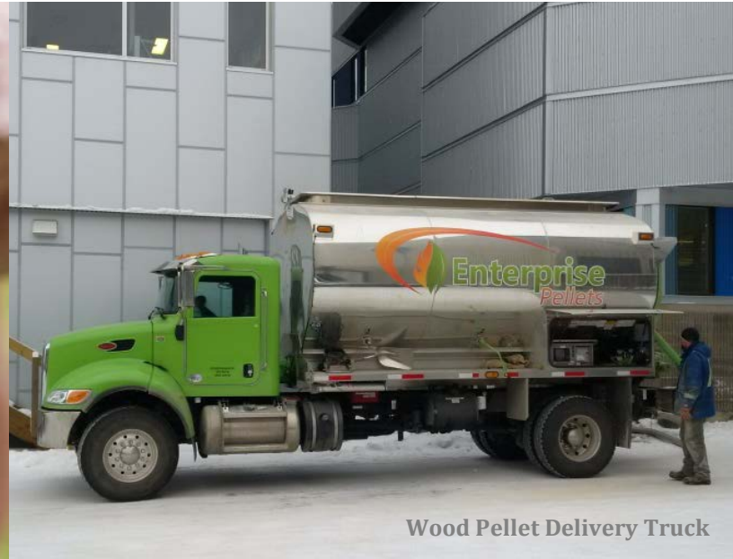
Wood Pellet Delivery Truck