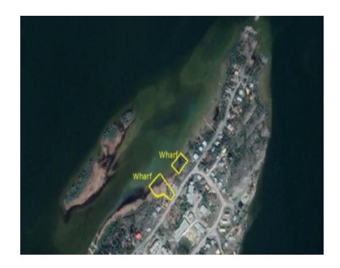
The new Ndilo Marine Docking and Boat Launch Facility will provide safe, modern, secure docking for marine vessels.