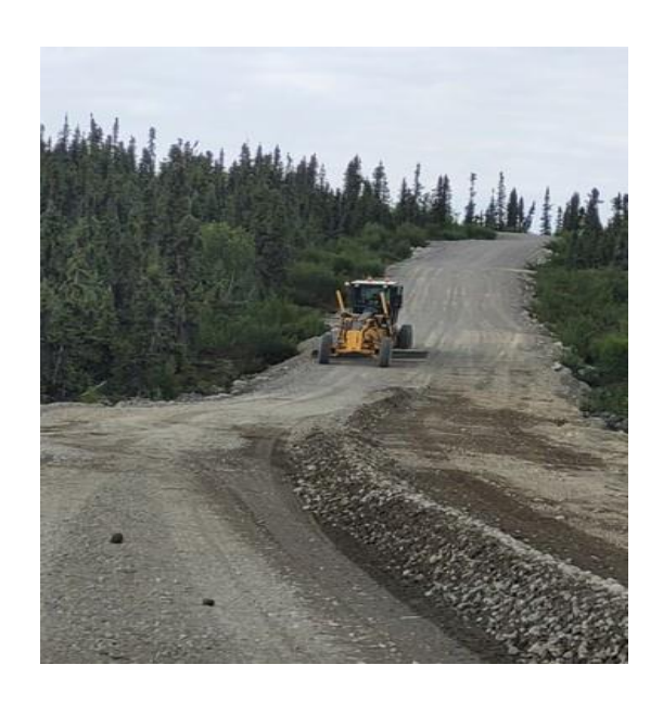
Grading operations as part of Summer 2021 continuation construction on the Wekweètì Access Road.