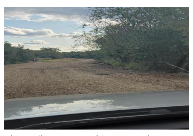
The 8-Mile Access Road in Fort McPherson to Nitaiinlaii.