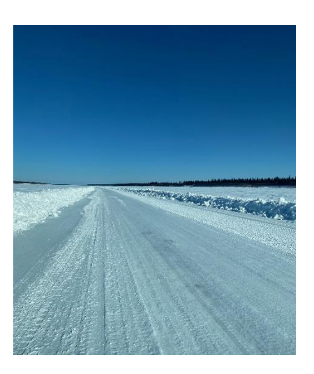
Driving along the 80KM Fort McPherson section of the Peel River Ice Road constructed from Fort McPherson to the Esau Creek midway point.