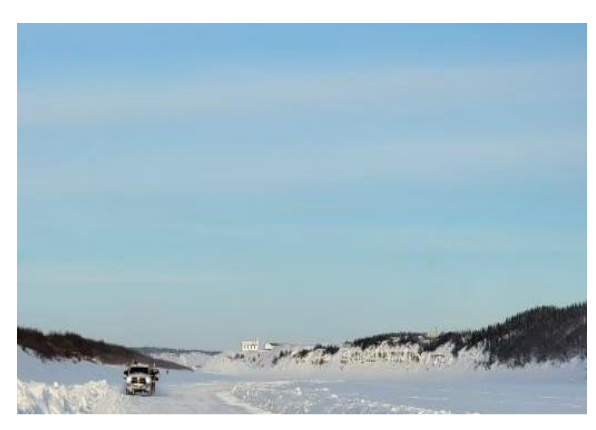
The Arctic Red River Winter Ice Road near Tsiigehtchic.