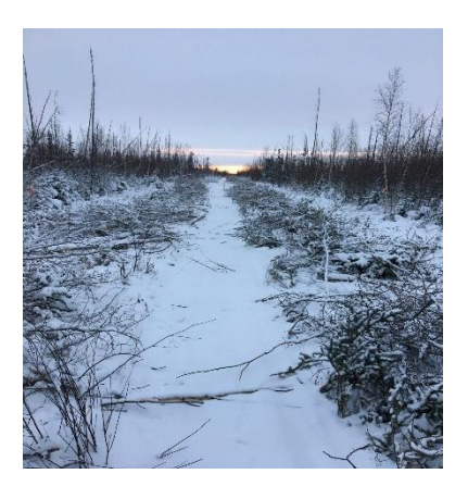
Construction underway along the new Four Mile Creek Quad and Walking Trail in Tulita.