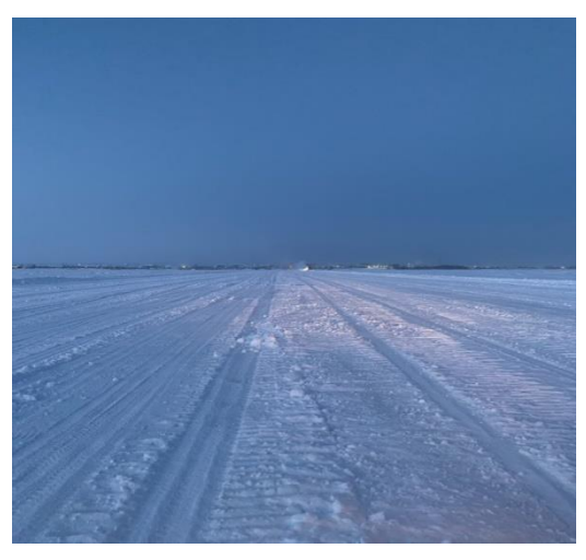
Driving on the Behchokò Ice Road "Connector" - Winter 2021-22.

The $36,196 in CAP funding covered the cost of ice profiling, ice road construction and maintenance. The Community Government of Behchokò contributed over $16,000 in in-kind maintenance services to the construction project.