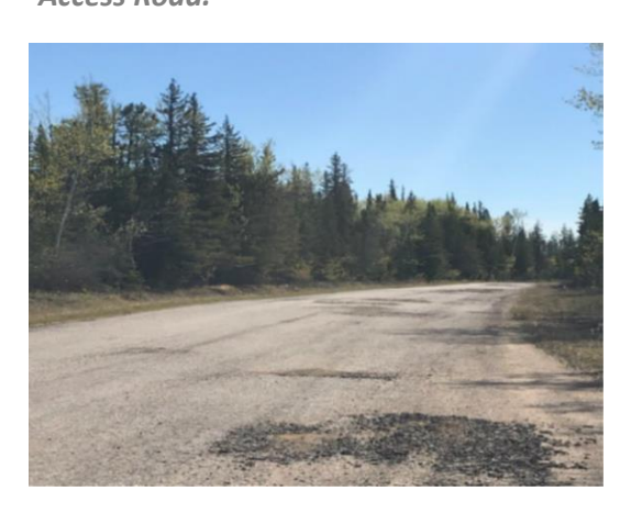
Curved section identified for resurfacing on the Hay River Golf Club and Ski Club Access Road.

The Town of Hay River was approved for $56,000 for Phase I construction upgrades and improvements to the Hay River Golf Club and Ski Club Access Road in Summer 2021.