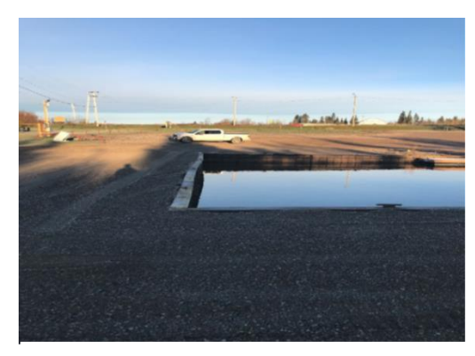
Porritt Landing Marina south shore retaining wall after completion of Summer 2021 continuation construction.