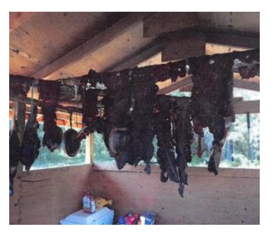
On-the-land harvesting at Jones Landing in Wrigley.