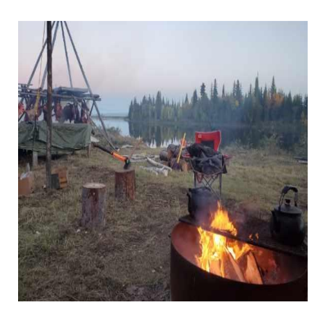
On-the-land activities at the Ka'a'gee Tu First Nation Cultural Camp/Community Camp trail in Kakisa.