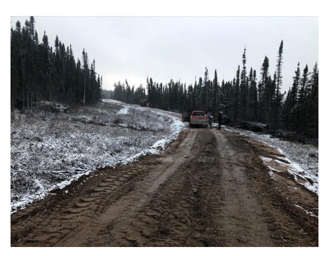
Construction underway on the Austin Lake Access Road in Łutselk'e.