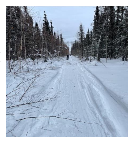
Access trails continuation construction - Nahanni Butte.