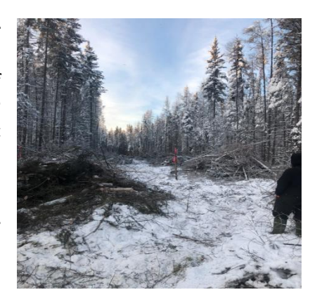
Phase I construction -Nahanni Butte Boat Launch and Boat Launch Access Road.

A total of three weeks was required to undertake the work to completion. When completed, community residents and visitors including tourists will have an upgraded boat launch from which to operate, as well as improved access connecting the boat launch and the community.