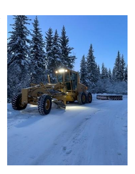
Winter 2021-22 grader operations on the Grande de Tour Winter Road in Fort Smith.