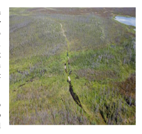
Aerial view of bridges constructed on the 3.6km community access ATV, snowmobile and Walking Trail to Secondary Beach in Whatì.