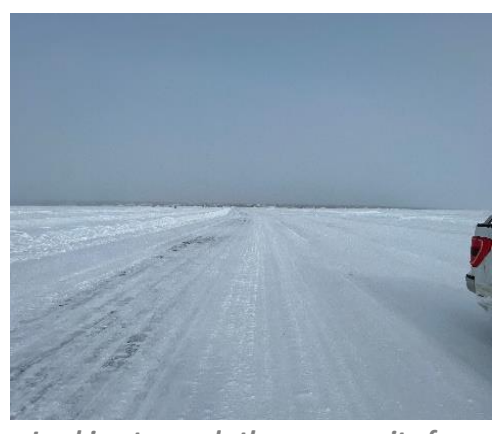
Looking towards the community from Great Bear Lake on the 22.5km Ice Road to Whiskey Jack Point in Dél<sub>i</sub>ne.