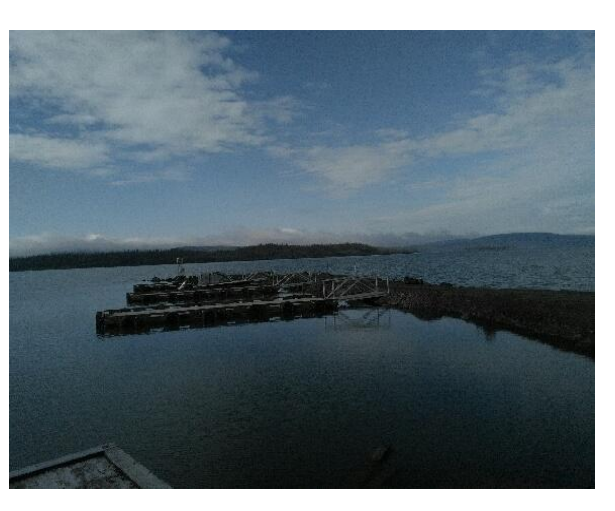
Łutselk'e Marine Facility after successful refurbishment of the three docks and the breakwater in Łutselk'e.