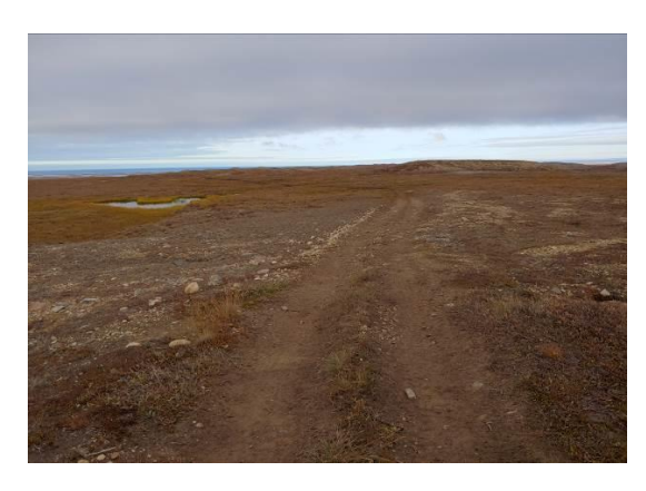
ATV and snowmobile community access trail outside of Paulatuk.