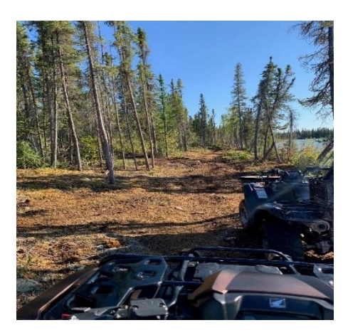
Construction underway on the 2.5 km community access ATV, snowmobile and walking trail to Lac La Marte in Whati.