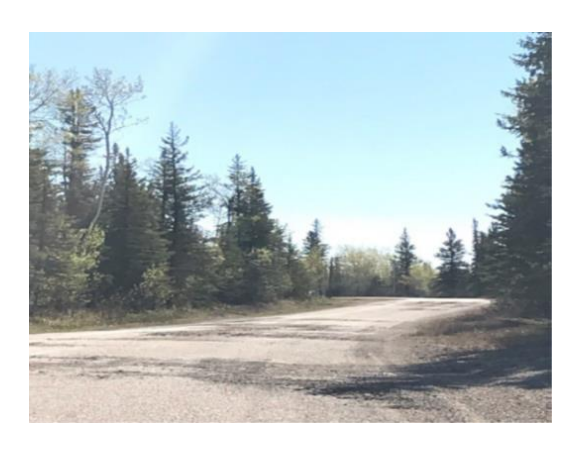
Section identified for resurfacing on the Hay River Golf Club and Ski Club Access Road.