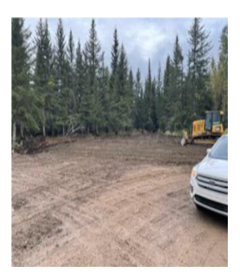
Construction work on the Nagel Channel Access Road and Boat Launch in Fort Resolution.