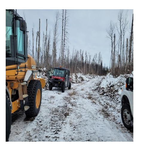
Construction underway on a section of the Cultural Camp/Community Camp trail in Kakisa.