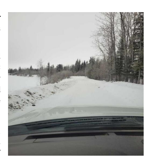
A view along the Thebacha Village Winter Access Road – Salt River First Nation.