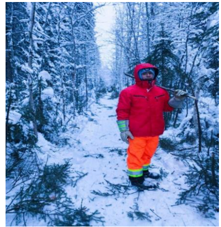
Winter 2022-23 access trails continuation construction in Nahanni Butte.