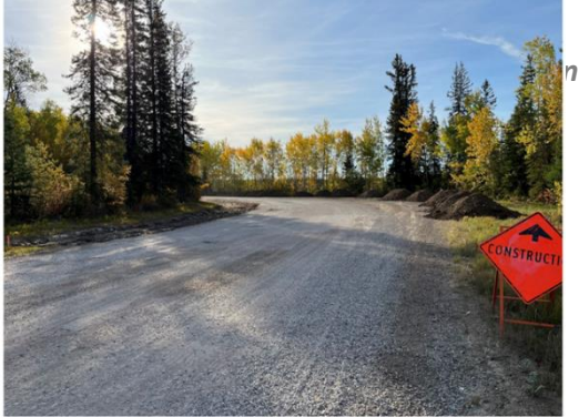
Curved section under construction on the Hoffman Way Access Road in Hay River.

Training and transferable skills development as an integral component of the construction project included operational experience in access road civil construction techniques and heavy equipment operation.