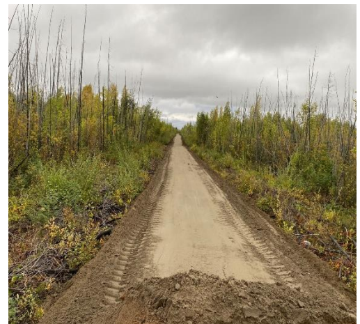
Summer 2022 trail construction on the Four Mile Creek Quad and Walking Trail in Tulita.