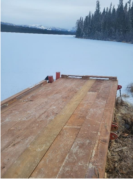
View from the dock after completion of construction upgrades and improvements looking out over Airport Lake.