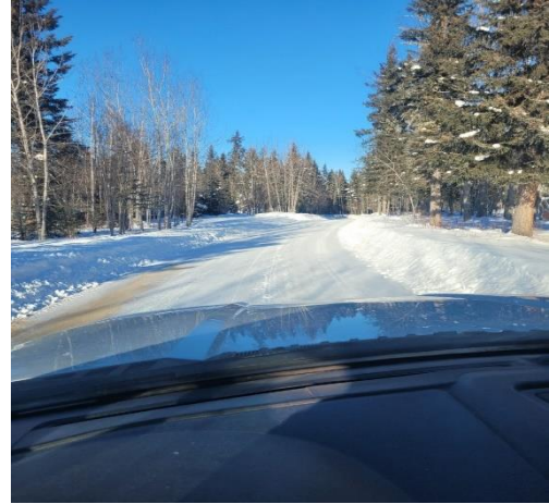
A view along a section of the Thebacha Village Winter Access Road – Salt River First Nation.