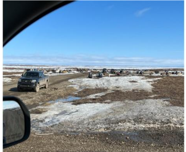
Community and area residents using the pull-off area already completed on the Husky Lakes Trail for harvesting, Spring 2022.