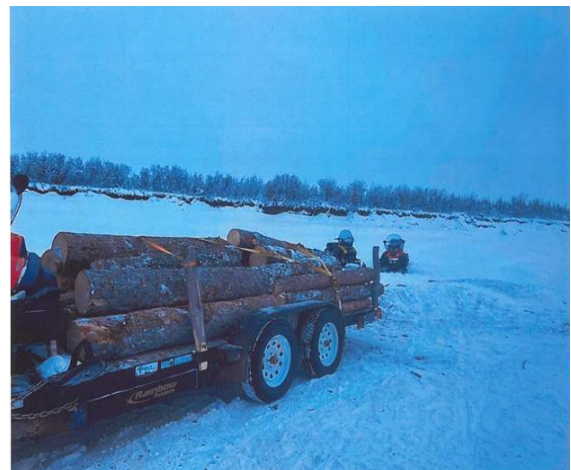
Family wood harvesting for home heating firewood on the Arctic Red River Winter Ice Road in Tsiigehtchic, Winter 2022-23.