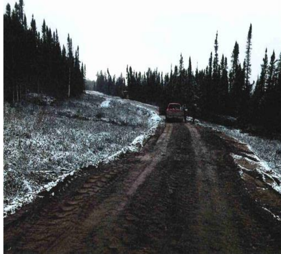
Construction proceeding on the Łutselk'e Bay Access Trail in Łutselk'e.