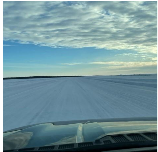
Looking towards Délıne from Great Bear Lake on the 22.5km Ice Road to Whiskey Jack Point in Délıne.