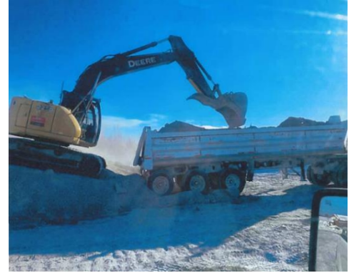
Winter 2022-23 gravel haul activity to support the Four Mile Creek Trail in Tulita.