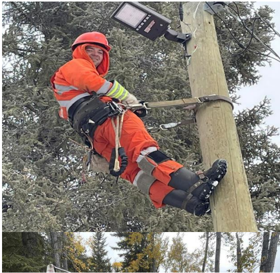
Line crew replacing sodium lighting with new LED lighting.

The Town of Hay River was approved for $49,750 to cover the cost of safety and accessibility improvements for a number of ski trails in Hay River.