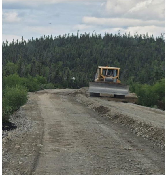
Bulldozer building up the road surface during Summer 2022 continuation construction on the Wekweètì Access Road.