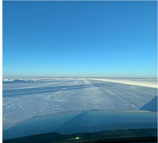
Driving on the Behchokò Ice Road “Connector” during the winter of 2022-23.