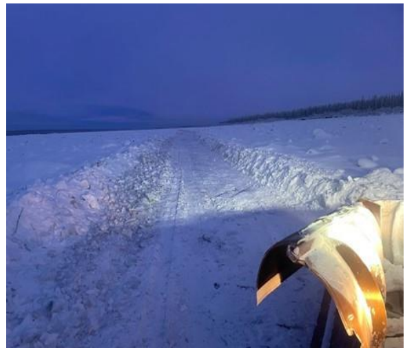
Initial construction proceeding on the 80km Fort McPherson section of the Peel River Ice Road from Fort McPherson to Esau Creek, Winter 2022-23.

Community residents employed on the project further developed transferable skills in operating and maintaining heavy equipment and ice road construction. Plow trucks and snowcats were utilized primarily, with four residents employed from December 2022-March 2023 as follows: