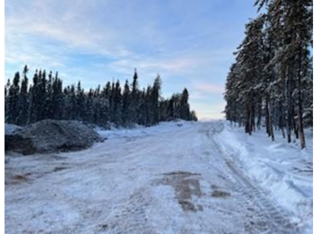
Construction proceeding on the Austin Lake Access Road in Łutselk'e.