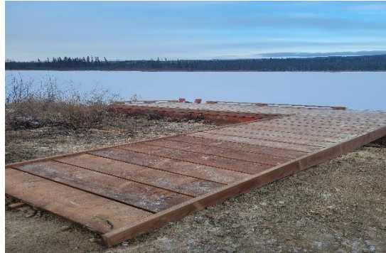
Airport Lake Dock after construction upgrades were completed.