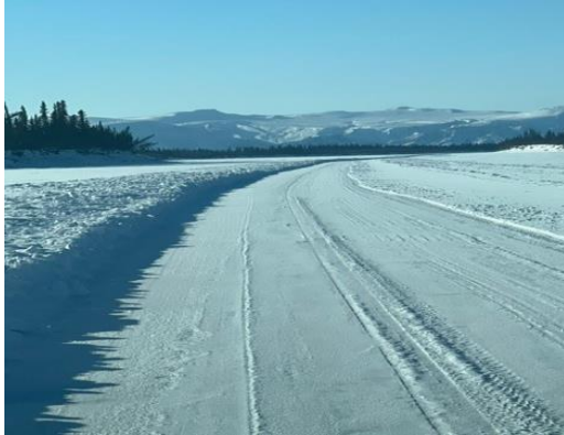
A view along the 80KM Aklavik section of the Peel River Ice Road from Aklavik.

$65,000 in funding was provided to construct and maintain the Aklavik section (80km) of the 160km Peel River Ice Road. Aklavik was responsible for constructing and maintaining its section of the ice road from Aklavik to the mid-way point at the Esau River.