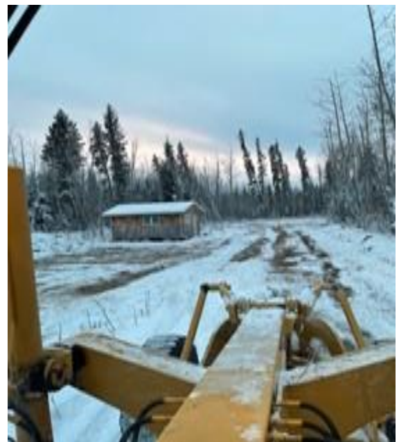
Grande de Tour Winter Road in Fort Smith.