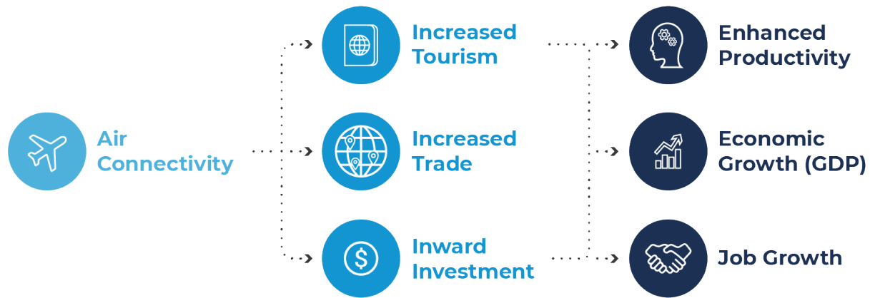
Figure 1-1: Catalytic Impacts Facilitated by Airports

Catalytic impacts extend beyond the straightforward employment and economic activity directly associated with airports. National economies are intricate ecosystems involving various stakeholders—government, businesses, infrastructure providers, residents, and more. For instance, if hotels had not been built in a country, tourism would significantly decline. However, catalytic impacts highlight that airports and their air services contribute to the overall size and affluence of the economy. While airports alone do not fully sustain economic activity, their connectivity remains a vital element for growth and development. 6